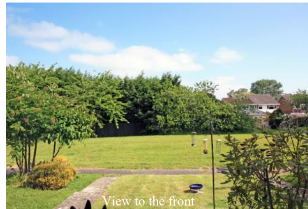
View to the front