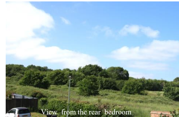
View from the rear bedroom

Hanley's Estate Agents 25 High Street, Highworth, SN6 7AG Tel: 01793 762005 mail@hanleys.co.uk