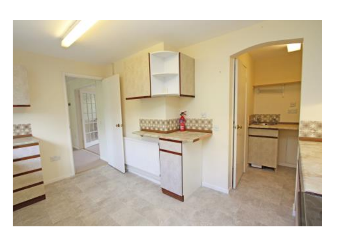
GROUND FLOOR 955 sq.ft. (88.7 sq.m.) approx.