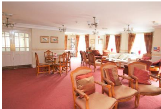
Residents' communal areas