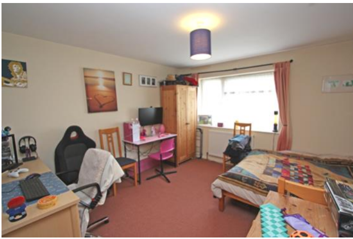
GROUND FLOOR 317 sq.ft. (29.5 sq.m.) approx.