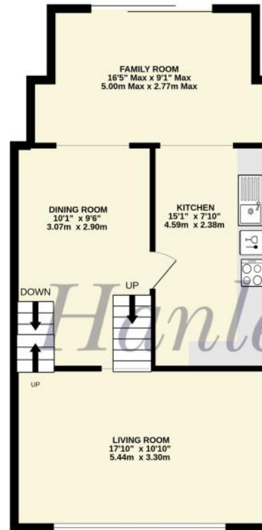
FIRST FLOOR 580 sq.ft. (53.9 sq.m.) approx.