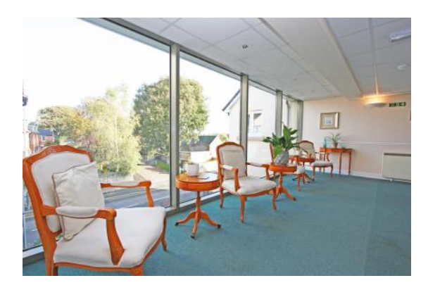
Residents' communal areas