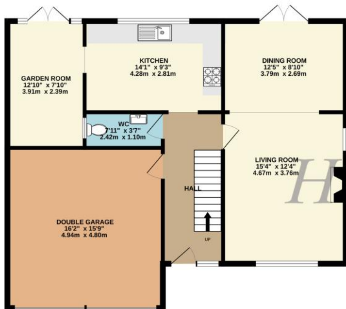
GROUND FLOOR 908 sq.ft. (84.4 sq.m.) approx.