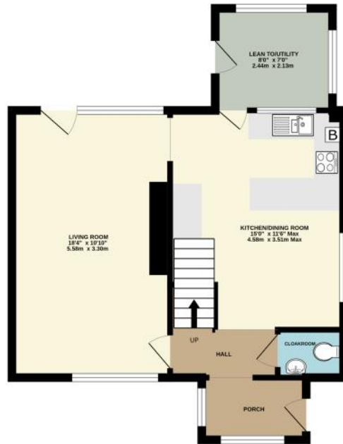
GROUND FLOOR 494 sq.ft. (45.9 sq.m.) approx.