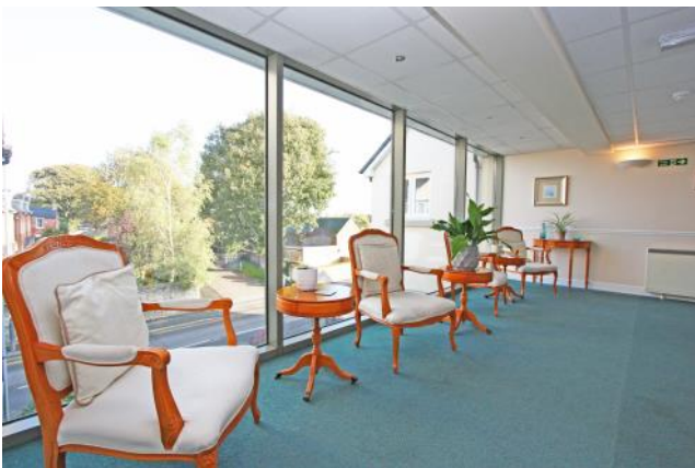
Residents' communal areas

GROUND FLOOR 481 sq.ft. (44.7 sq.m.) approx.