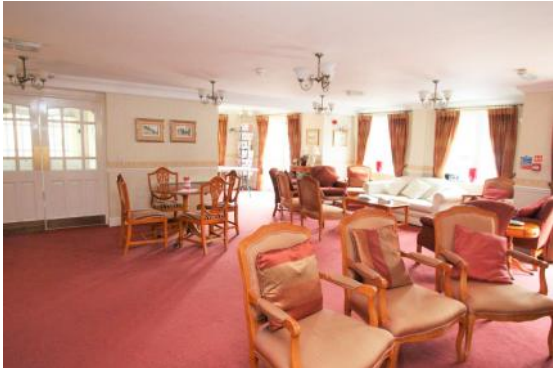
Residents' communal areas

FIRST FLOOR 457 sq.ft. (42.5 sq.m.) approx.