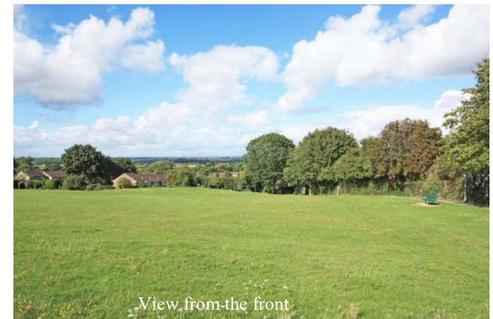
View from the front

DISCLAIMER. These particulars, whilst believed to be accurate are set out as a general outline for guidance and do not constitute any part of an offer or contract. Intending purchasers should not rely on them as statements or representation of fact, but must satisfy themselves by inspection or otherwise as to their accuracy. No person in this firm's employment has the authority to make or give any representation or warranty in respect of the property. Floor plan measurements and distances are approximate only. We have not carried out a detailed survey nor tested the services, appliances or specific fittings. Your home is at risk if you do not keep up repayments on a mortgage or other loan secured on it.