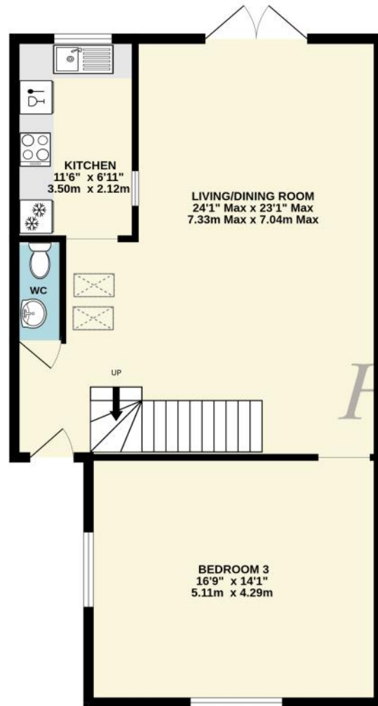
GROUND FLOOR 738 sq.ft. (68.6 sq.m.) approx.