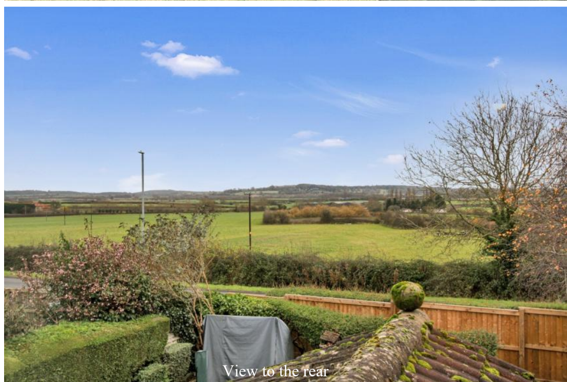
View to the rear