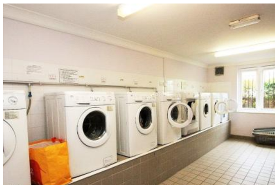
Residents' communal facilities and garden