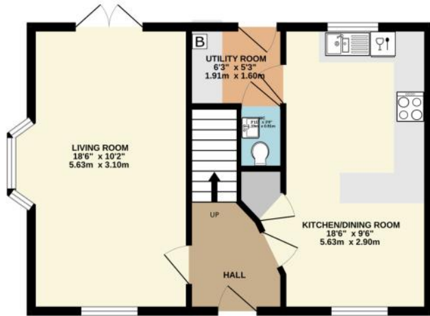
GROUND FLOOR 483 sq.ft. (44.9 sq.m.) approx.