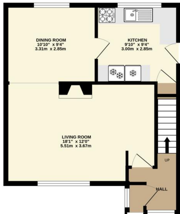
GROUND FLOOR 599 sq.ft. (55.7 sq.m.) approx.