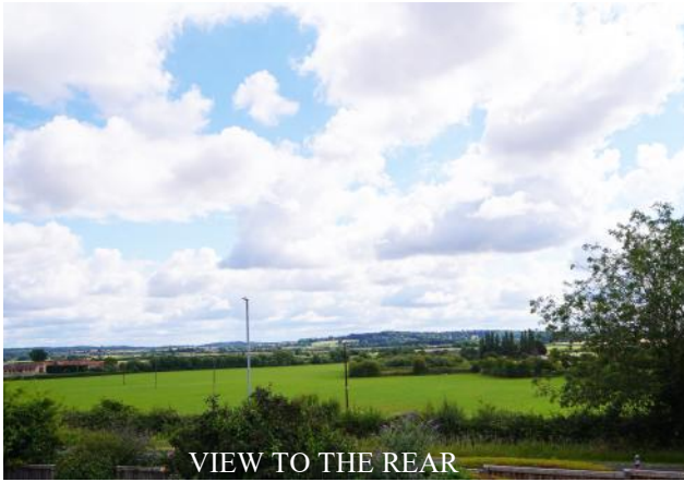
VIEW TO THE REAR